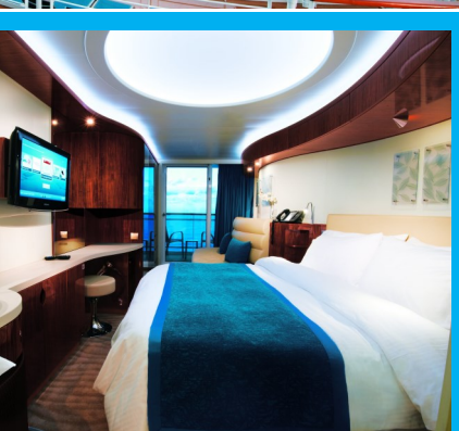
ADDITIONAL CABIN CATEGORIES AND OCCUPANCY RATES AVAILABLE UPON REQUEST.