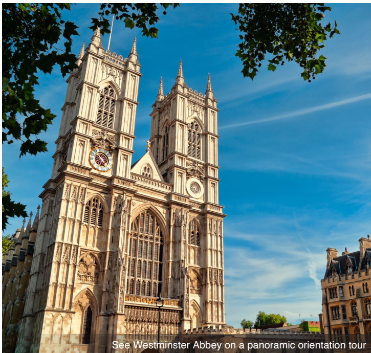
See Westminster Abbey on a panoramic orientation tour