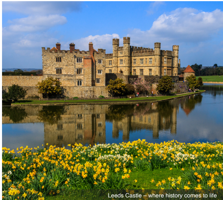
Leeds Castle – where history comes to life

DAY 1 Depart the USA: Depart the USA on your overnight flight to London, England.