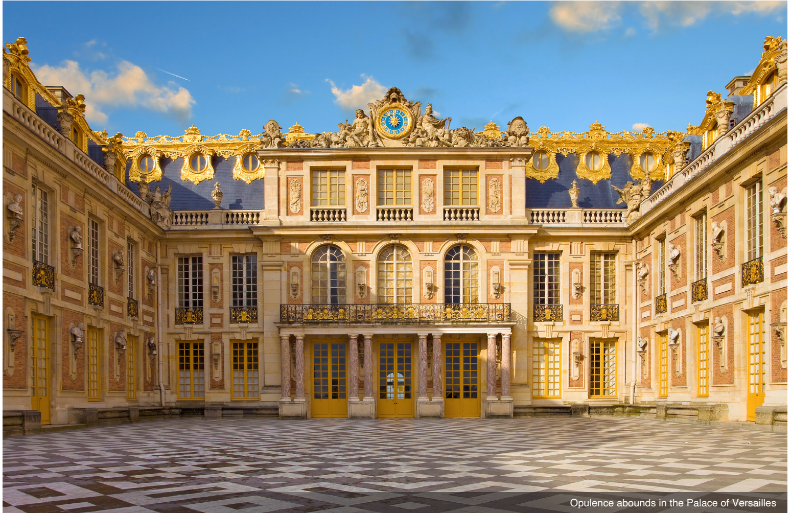
Opulence abounds in the Palace of Versailles