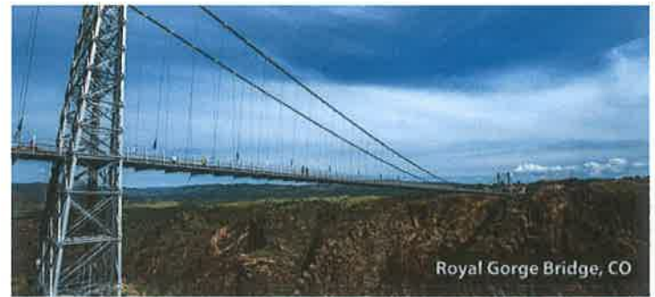
Royal Gorge Bridge, CO