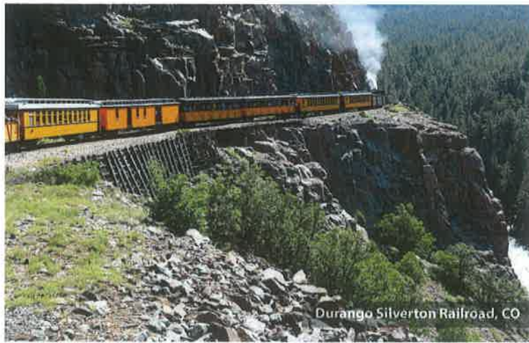
Durango Silverton Railroad, CO

This morning we'll board the Durango Silverton Train to enjoy a half-day ride through the canyons of Colorado's spectacular La Plata and San Juan Mountains. Drink in the beauty of snow-capped peaks and rushing mountain streams before arriving in the historic mining town of Silverton where we'll scatter for lunch. Afterwards, we'll travel over Red Mountain on the Million Dollar Highway. Visit the UTE Indian Museum before arriving in Grand Junction for our overnight stay. Meals: B