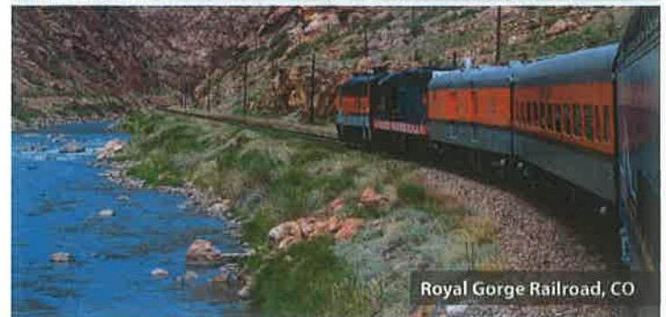
Royal Gorge Railroad, CO