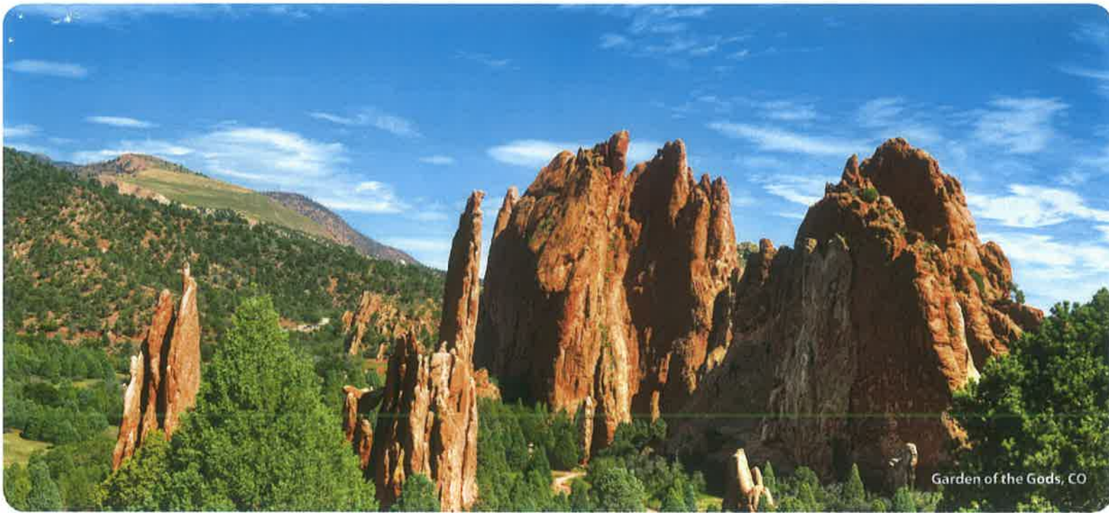
Garden of the Gods, CO